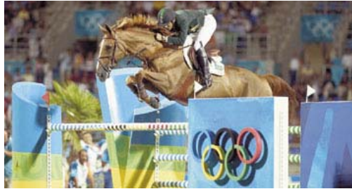
Baloubet du Rouet